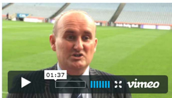
Why get started with Energy Management?