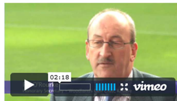
Hear from SMEs that have saved energy