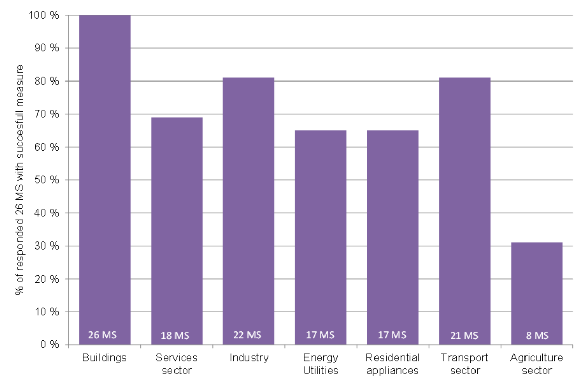
Figure 1: Proportion of 26 MS reporting they have at least one successful measure in the sector

All 26 MS respondents reported they have at least one successful PaMs in the buildings sector which are seen to be working and contributing to energy savings targets. Industry and, perhaps surprisingly, transport are the next best sectors covered with over 80% of MS considering they have a successful policy. Fewer MS reported successful policies for energy utilities (65%), residential appliances (65%) and the services sector (54%). For the agriculture sector only 8 of the responding 26 MS have successful measures.