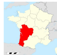
Nouvelle-Aquitaine region , France