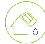
Solar thermal panels