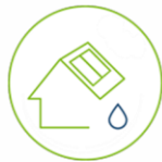
Solar thermal panels